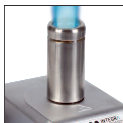
Long burner head