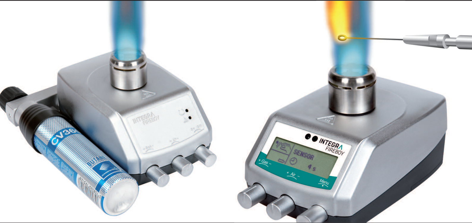
FIREBOY Safety Bunsen Burner