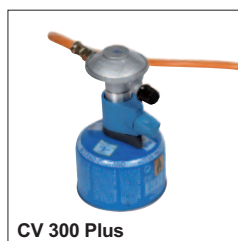
CV 300 Plus