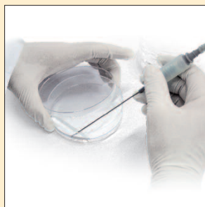
Coating of Petri dishes