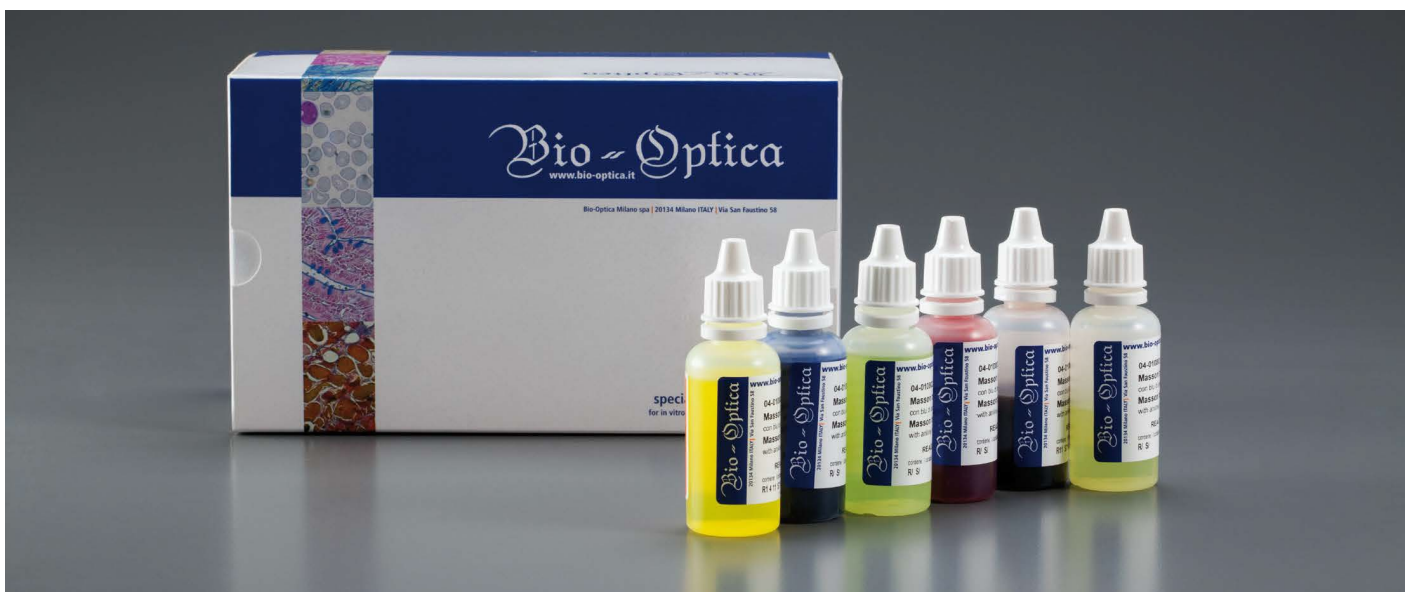
The picture is for illustrative purposes only